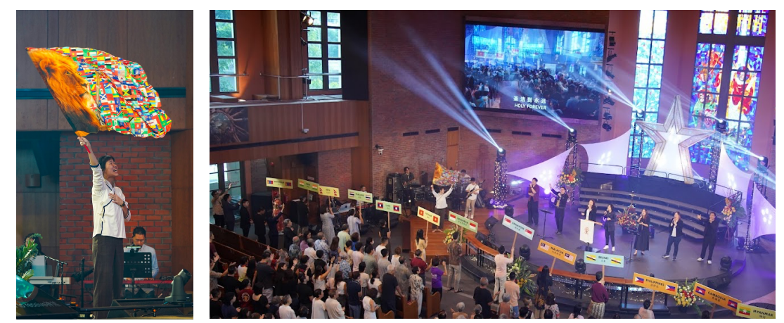
The parade of nations was a picture of a time to come when God would reign over every nation, tribe and people (Revelation 7:9)

在2023得力之年,我们装备了自己和我们的细胞小组,并在2024 的参与之年祝福社区。现在,PLMC大家庭进入2025扩展之年,重 点祝福各国。异象主日(1月5日),主理牧师高时敏牧师博 士挑战我们今年与上帝同行时,扩展我们的思想、心灵和信心。