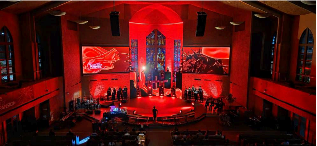
PLMC's Holy Week observances included the meditative Tenebrae service of darkness, as we pondered Jesus' journey to the cross.. PLMC 圣周纪念活动包括冥想的黑暗和阴影的Tenebrae仪式，引导我们思考耶稣走向十字架的旅程。