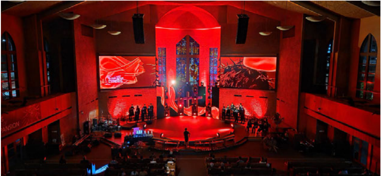
PLMC's Holy Week observances included the meditative Tenebrae service of darkness, as we pondered Jesus' journey to the cross.. PLMC 圣周纪念活动包括冥想的黑暗和阴影的Tenebrae仪式，引导我们思考耶稣走向十字架的旅程。