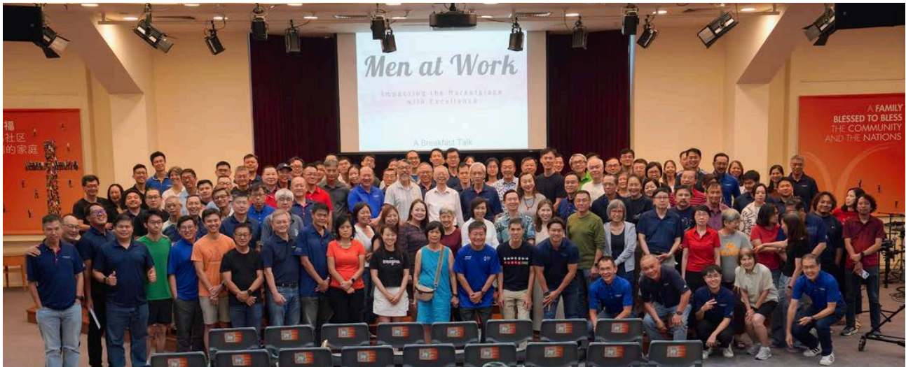
PLMC members with distinguished guest speaker Mr Lim Siong Guan, who shared about leading with excellence in the marketplace