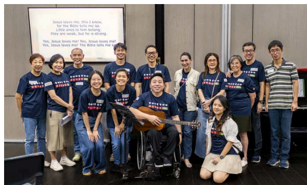
PLMC's Inclusivi-TEAM and co-workers PLMC 的包容性团队和同工。