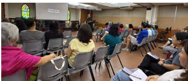
"We Believe" - A talk held on 6 Sept 2025, by Bishop Emeritus Wee Boon Hup, in commemoration of the 1700 th anniversary of the Council of Nicaea, which began the process of formulating the Nicene Creed.